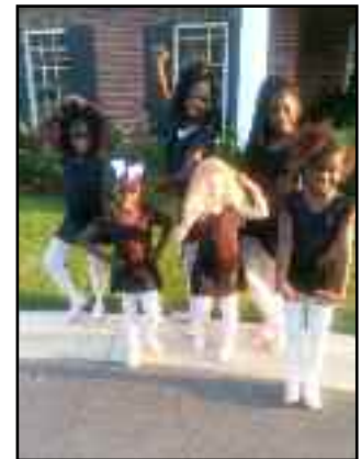
Learning a New Talent!