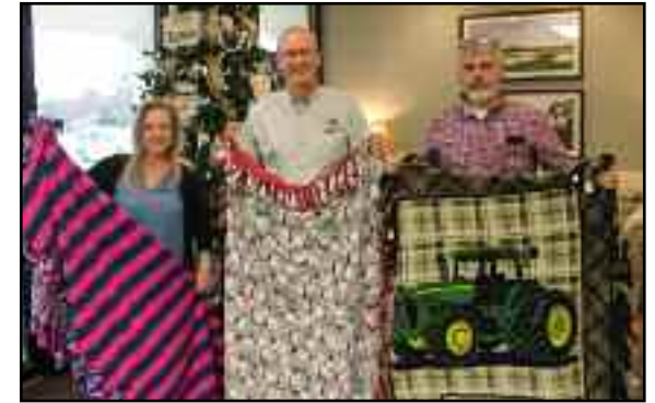
Thank you First Baptist Natchitoches for the beautiful handmade blankets!