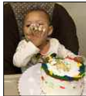
Celebrating a Birthday!