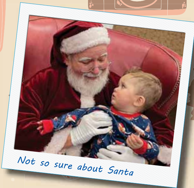
Not so sure about Santa