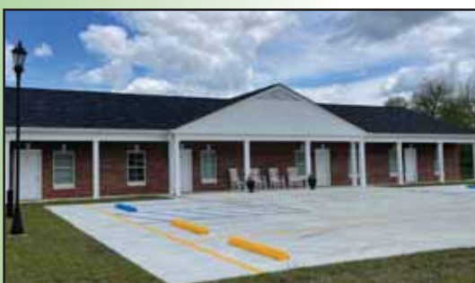
Above: Praise Apartment Complex Below: Interior photos from Praise Apartments.