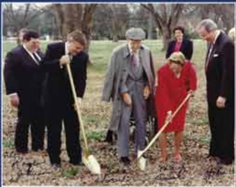
GROUNDBREAKING: January 27, 1997