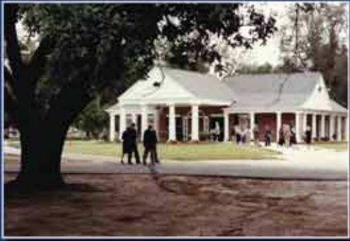
DEDICATION: October 10, 1997