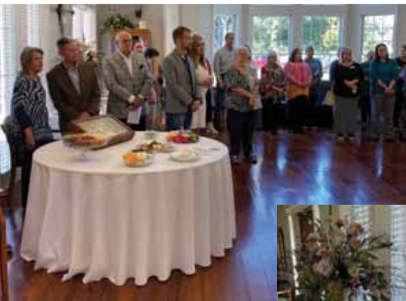
Above and center: Friends along with current and former staff gather for the celebration