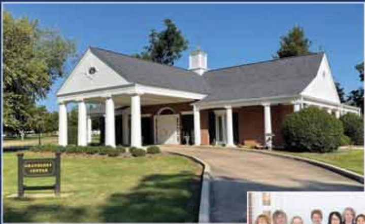
MAIN OFFICE 2022

Granberry Counseling Centers continue to answer God's call to care for individuals, couples, and families across the state through professional Christian counseling. In the past 25 years, through more than 128,000 appointments, over 30,000 clients have been served. Since 2002, 575 Louisiana Baptist ministers and their families have been helped through Granberry's partnership with the Louisiana Baptist Convention Pastoral Leadership Team. "Where there is no counsel, the people fall; But in the multitude of counselors there is safety" (Proverbs 11:14).