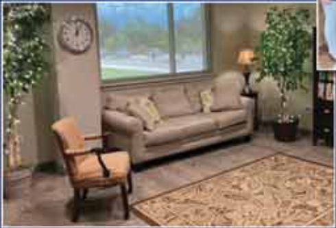
COUNSELING OFFICE COVINGTON